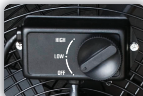
HIGH/LOW Two-Speed Dial