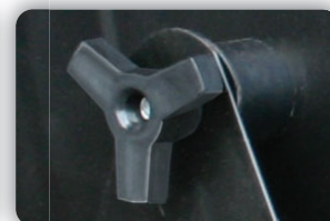
Fan Tilt Adjustment Knob

Due to our continual effort to provide the best products available and adhere to market conditions; literature, products, prices and availability are subject to change without notice.