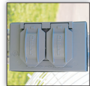
Independent Fan & Mist Switches