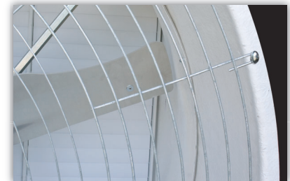
Heavy duty guard is hot dip galvanized after welding to protect from corrosion.