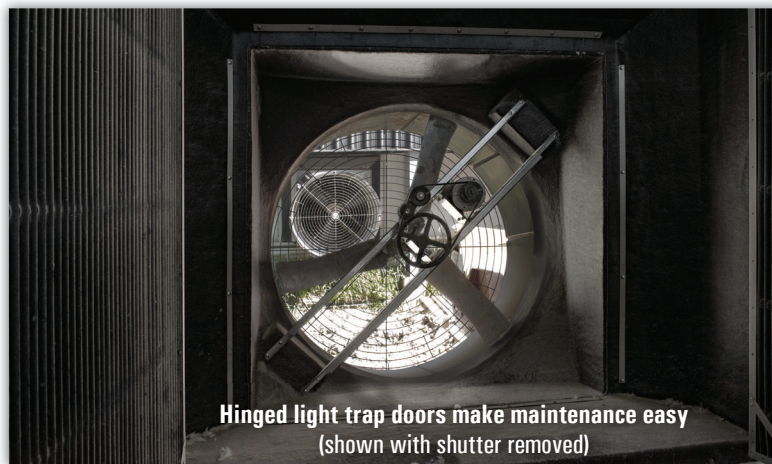
Hinged light trap doors make maintenance easy (shown with shutter removed)