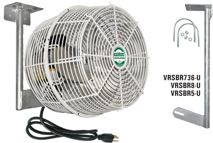
VRSBR736-U VRSBR8-U VRSBR5-U

J&D Manufacturing's design allows for more air flow and a consistent air pattern. This maximizes heat distribution and humidity control by mixing the air, from ceiling to floor – under, over and around your plants.