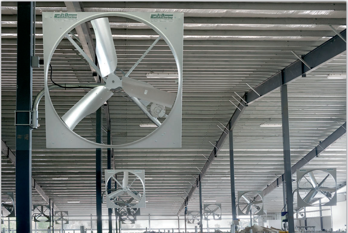
Belt Drive Panel Fans with Galvanized Prop and VRSBRS06X Swivel Offset 6" Square Column Mounting Brackets